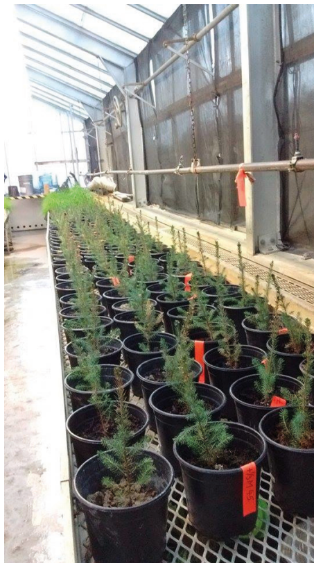
Fig. 1. Randomized distribution of 130 potted black spruce seedlings on the greenhouse bench. The pots contained black spruce seedlings transplanted into six substrates prepared from field-harvested material collected in a spruce-feather moss site located on the Clay Belt of Quebec and Ontario (Canada).

K, Ca and Mg by plasma atomic emission spectroscopy (Thermo Jarrel-Ash-ICAP 61E, Thermo Fisher Scientific, Waltham, MA).