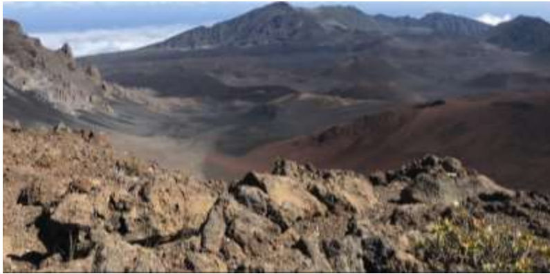
Brown barren wastelands covered with flies and rotting flora. Not a house to be found. Dark, dry, and gloomy.