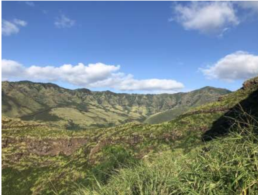
Sheer slopes covered by fluffy clouds. The slopes are pristine and untouched as they tower over the landscape.