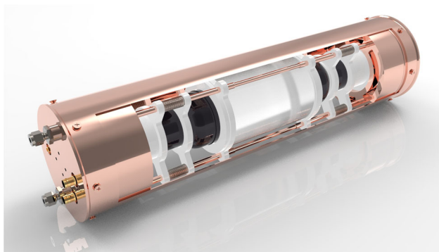
Fig. 1 Rendering of the detector module for the SABRE-PoP phase. The crystal is placed in a copper enclosure; the crystal wrapping is not shown. Two PMTs (black body) are coupled on each end of the crystal. PTFE holders (white) and copper rods keep the crystal and the PMTs in position

to assembly to remove any residual water. After the sealing, the detector module will be flushed with high purity N_2 gas to avoid humidity and radon. The cylindrical part of the enclosure has a diameter of 14.6 cm, a height of 58 cm and a thickness of 2 mm. It is closed by a shaft seal with Viton® O-rings. The enclosure sits vertically and the top end-cap is furnished with bulkhead feedthroughs for the PMT high voltage and signal cables and for teflon tubes. The latter will allow flushing of the inner volume with dry nitrogen gas. The copper enclosure will be placed inside a 1.3 m (diameter) \times 1.5 m (length) cylindrical vessel filled with about two tons of pseudocumene and instrumented with ten 8-inch PMTs. The vessel is made from low-radioactivity stainless steel with access via a 60 cm diameter flange at the top. The vessel's inner surface is coated with Ethylene tetrafluoroethylene (ETFE) to prevent scintillator degradation due to direct contact with the stainless steel. A Lumirror™ liner with 95% reflectance above 400 nm is applied inside to improve light reflection. Each flat end of the vessel hosts five Hamamatsu R5912-100 PMTs with 35% quantum efficiency at 390 nm. The liquid scintillator is (1, 2, 4) Trimethylbenzene (pseudocumene, PC) from the Borexino facility [28], doped with 3 g/l of (2,5)-diphenyloxazole (PPO), which acts as wavelength shifter. The expected light yield is 0.22 photoelectrons/keV ee [29].