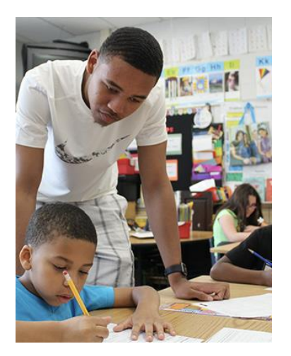
WMU hosts inaugural Inspiring Future Teachers of Color conference