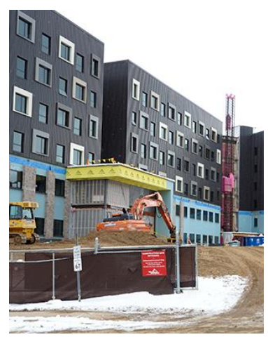
Final parking strategy set for Arcadia Flats