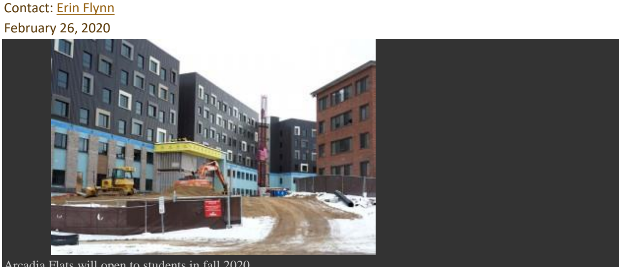
Arcadia Flats will open to students in fall 2020.

KALAMAZOO, Mich.—In response to input at recent public sessions, nearly 200 parking spaces will be added near the new Arcadia Flats student housing development when it opens in the fall.