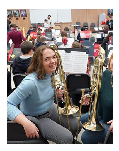
Music students slide to the top in national trombone competition