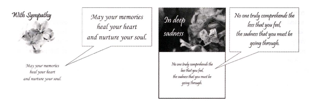
Figure 21.2 Depiction of a prototypical American (left) and German (right) sympathy card.

may be to avert the gaze from someone who is suffering (e.g., a homeless person asking for money) for fear that the person who is suffering may make them feel bad. Some preliminary data support this prediction: when presented with one image that could either be perceived as a suffering face, a laughing face, or both, the more participants wanted to avoid feeling negative affect, the more likely they were to report seeing only the laughing face (Koopmann-Holm, Bartel, Bin Meshar, & Yang, in preparation). These findings suggest that cultural differences in avoided negative affect may have consequences for the experience of compassion. For instance, because people must perceive another's suffering before they can experience compassion, it is possible that the more individuals want to avoid negative affect, the less likely they may be to put themselves in situations in which they might observe the suffering of another person. The less likely people are to see other people's suffering, the fewer opportunities they have to experience compassion.