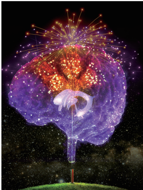
Firework pattern GBM genesis (metaphor)

Mutations oftentimes start with TERT promoter mutations in cells of the astrocytic ribbon in SVZ under the ventricle ( TERTp^+ in Fig. 1A). With additional mutations in oncogenes, the mutated cells from SVZ migrate to the cortex and manifest as the GBM (Fig. 1A, right) 43 . The authors searched for mutations in triple-matched samples of tumor-free SVZ, GBM tumor, and normal brain cortex (or blood) 43 . The authors have hypothesized that the SVZ, which includes neural stem cells, is suspected of being the origin of tumors 43 ; mutations then progress from the SVZ to the tumor mass. In addition to this directionality, the number of mutations increases dramatically after the cell-of-origin reaches the cortex. As described in the previous study of Lee et al. 43 , about 20 different somatic mutations of SVZ that contribute to the mutational patterns increased to around 100 mutations in the tumor. Furthermore, mutational signature 1 dominated most mutations in tumors, whereas mutational signature 5 was preserved