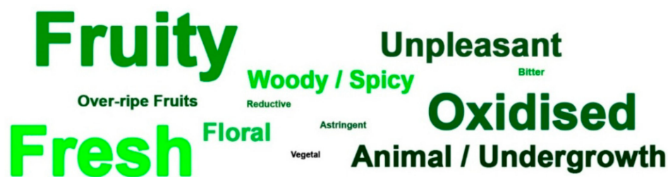
Figure 2. Word cloud of the descriptors elicited by the white wines considered to be organic (SB2016, VB2015, CC2013).

The responses given in the guess session may be considered as the psychological construct of a wine supposed to be organic wine by trained and knowledgeable tasters. Gathering the flavour descriptions and the emotional responses for white (Figure 2) and red wines (Figure 3) in a word cloud (font size according to frequency of occurrence) it becomes evident what may be regarded as the flavour and emotional profile expected to characterize organic wines for an experienced cohort.