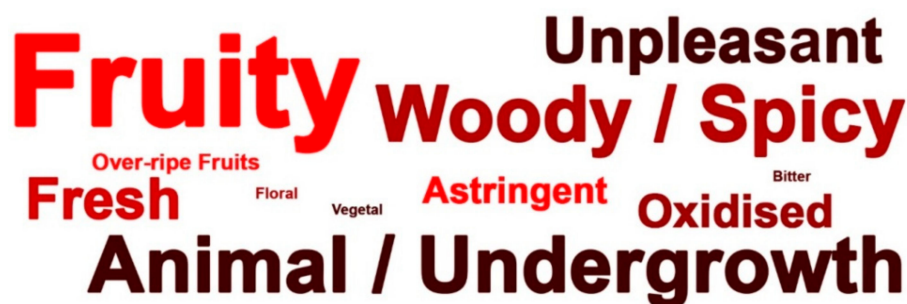
Figure 3. Word cloud of the descriptors elicited by the red wines considered to be organic (ST2012, ST2014, PN2015).