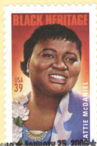
First Day of Issue - January 25, 2006 - Beverly Hills, CA 90210

From 1947 until 1952, McDaniel played the title role in The Beulah Show , broadcast on national radio. Demonstrating her popularity and power, McDaniel successfully negotiated the right to alter scripts of which she did not approve.