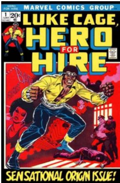
Figure 4. The cover of Luke Cage’s first issue has many aspects of the blaxploitation genre depicted such as sex, prison, and drug use. Reprinted with permission from Marvel Comics Luke Cage Hero for Hire # 1 by Goodwin,1972.

the first cover featuring John Stewart as well. Stewart is shown standing over Green Lantern and saying that “they whipped Green Lantern now let’ em try me!”.