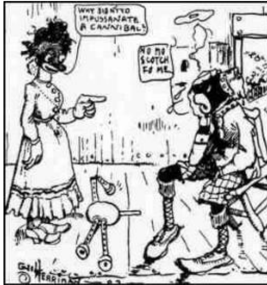
Figure 2. Musical Mose focuses on an African American man who was trying to make it as a musician by hiding his race. Similar to the creator George Herriman hiding his half Black heritage. Adapted from The Pulitzer Papers by Herriman, 1902.

racial classifications. In comparison, other writers such as Will Eisner created African American characters based on stereotypes.