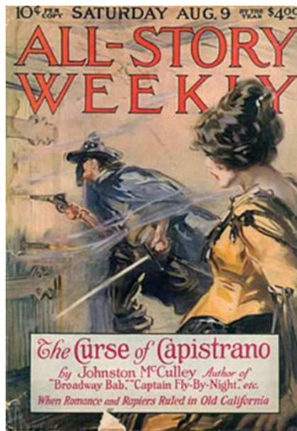
Figure 5. The first novel featuring Zorro, which would later inspire Douglas Fairbanks to make a Zorro movie. Adapted from Curse of Capistrano by McCulley, 1919.

2011) (Figure 5). His main character, Don Diego de La Vega, is the son of a wealthy landowner in 1800s California who projects himself as lazy and cowardly to avoid the people around him learning of his crime-fighting activities as Zorro (Hind 2011).