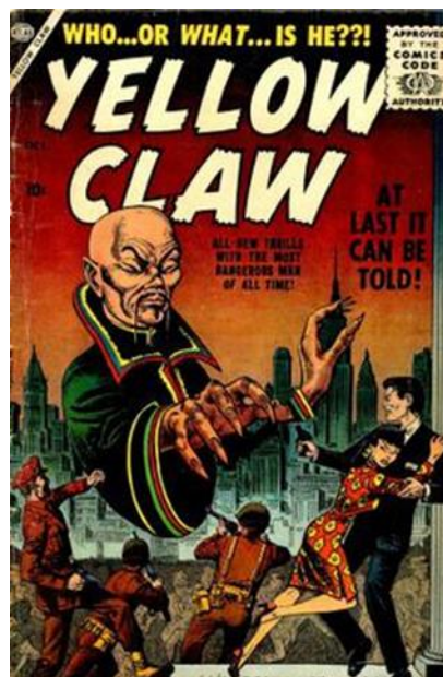
Figure 7. The villain Yellow Claw presented fears of communism in the 1950s. Reprinted with permission from Marvel Comics from Yellow Claw #1 by Feldstein 1956.

Representations like Yellow Claw , as shown in Figure 7, show how the fear of immigration still exists within the United States and how the concept of the “other” transferred from the Japanese to Chinese Americans. In the comic Yellow Claw , we see the fear of communism expressed through Chinese representations in the series which shows the villain Yellow Claw focusing on dominating Western civilization. The representation of Chinese people within this story once again reflects the political fears of the United States being taken over by communists. Based on the historical events of the 1950s, it is not surprising that Chinese representations in comics focused on the fear of communism.