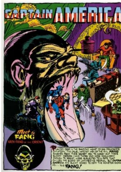
Figure 6. The typical representation of Asians, especially the Japanese, during WWII. Often showing Asians as fanged non-humans. Reprinted with permission from Marvel Comics from Captain America #6, by Simon 1941.

The fact that the Japanese were represented in such a way during World War II greatly affected the policy surrounding them during the war and the treatment of Japanese Americans at the time. However, to be accurate, it was not only the Japanese who were imprisoned during World War II but also German and Italian immigrants within the United States, mostly due to such dominating propaganda within American comics. During World War II, 31,275 people were interned; of these people, 17,477 were of Japanese ancestry (Kashima 2003).