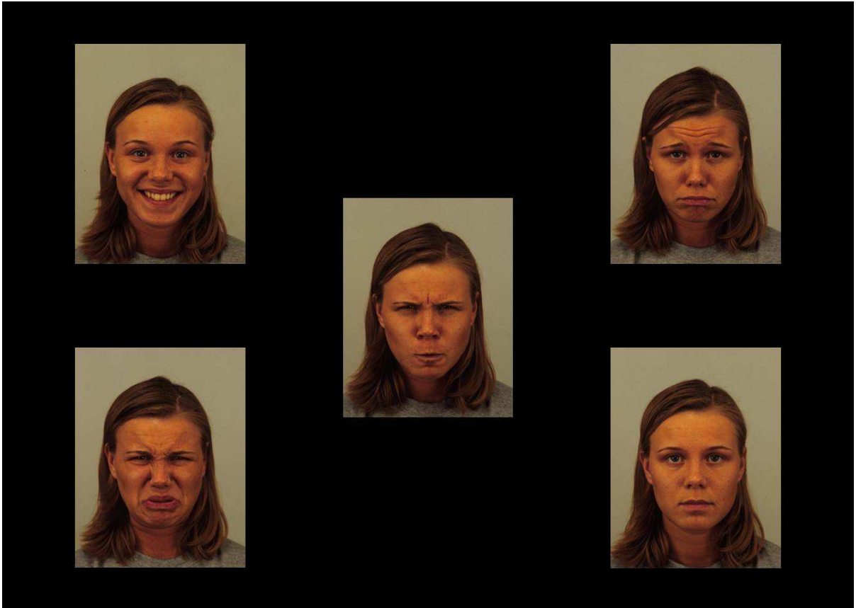
Figure 1. An example trial used in the eye tracking tasks. Top Left = happy, Top Right = sad, Center = angry, Bottom Left = disgust, Bottom Right = neutral.