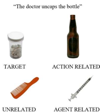
Figure 1. Combination of visual and linguistic stimuli.

4. unrelated objects were not congruent with the agent, verb, or agent-verb combination.