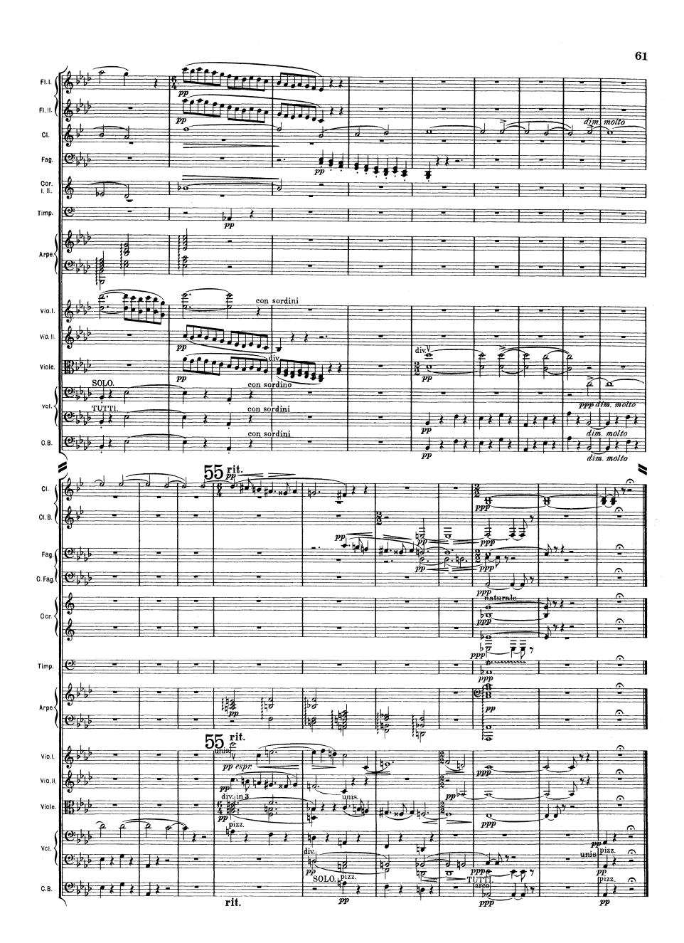
Example 3: Elgar, Symphony No. 1, close of first movement

or a new harmonic language (even if it gestures towards the possibility of one). It is, in short, a typical reactive response to the propositions of musical modernism, generating 'reactionary novelties' appropriate to the new post-