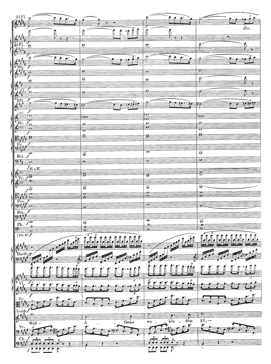
Example 2: Wagner, Tristan und Isolde, conclusion

Elgar's typical solution to the problem of resolution no doubt derives from Wagner's but it is qualitatively different. The first movement of his First Symphony is, despite the score's title, 'Symphony in Ab', mostly in A minor. The ostensible tonic 'immures' this 'immured' A minor, but in an unsat-