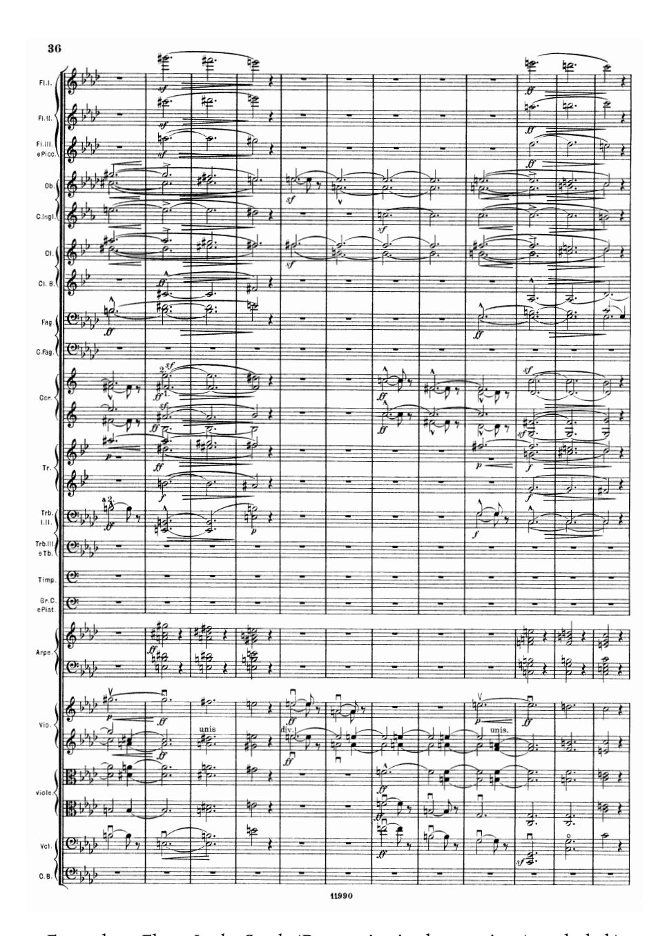
Example 4: Elgar, In the South, 'Romans' episode, opening (concluded.) are much more like Elgar's episode here (see Example 4).32 But the 'new'