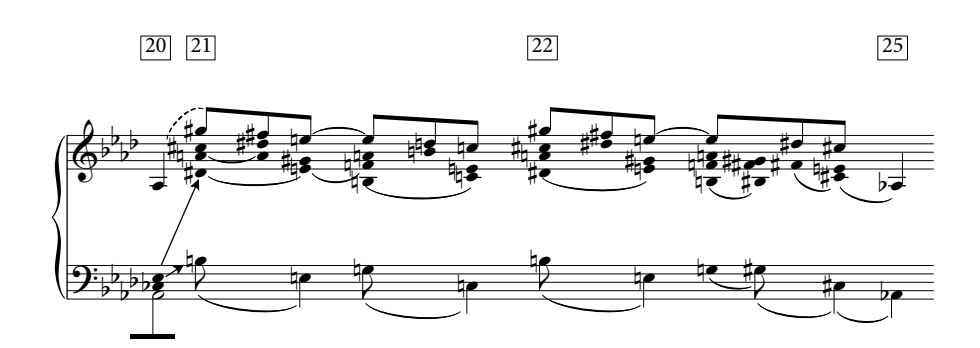
Example 5: Elgar, In the South, analysis of part of the 'Romans' episode

musical sound-world alluded to here is brought quite tidily into a tonal ambit (see Example 5).