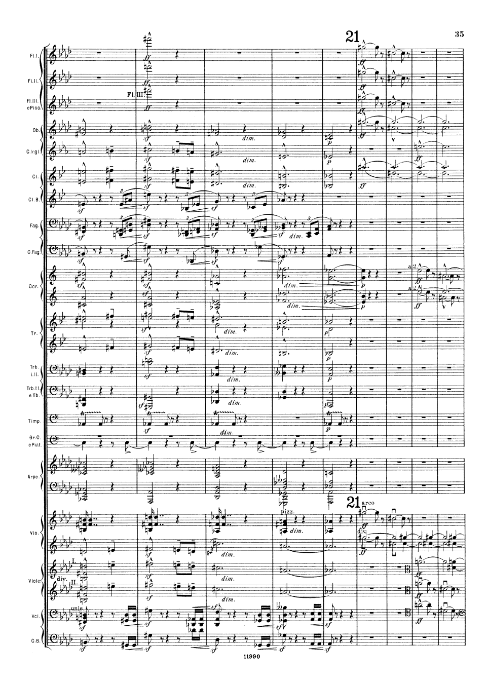
Example 4: Elgar, In the South, 'Romans' episode, opening (continued)

November 1904 premiere of In the South , Mahler's Fifth Symphony was itself premiered (18 October). The opening shrieks of Mahler's second movement