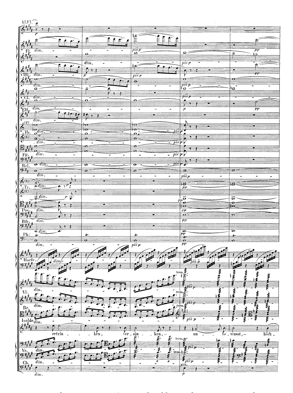
Example 2: Wagner, Tristan und Isolde, conclusion (continued)

isfying way. The symphony's grand, processional opening theme returns in the movement's closing pages, but at figure 55 (see Example 3) a theme associated with the immured A minor returns as a troubling reminder of that key and the challenge it poses to the hegemonic function of 'the tonic' Ab.