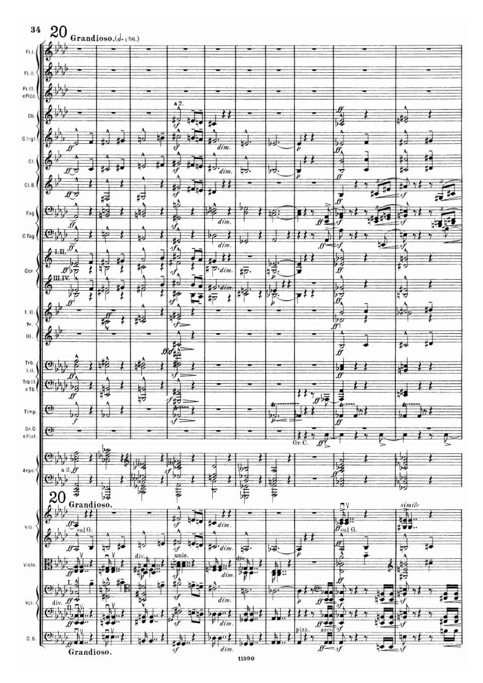
Example 4: Elgar, In the South, 'Romans' episode, opening

bear comparison to post-Second String Quartet Schoenberg, the context is still 1904. A better comparison can be found: four weeks or so before the 22