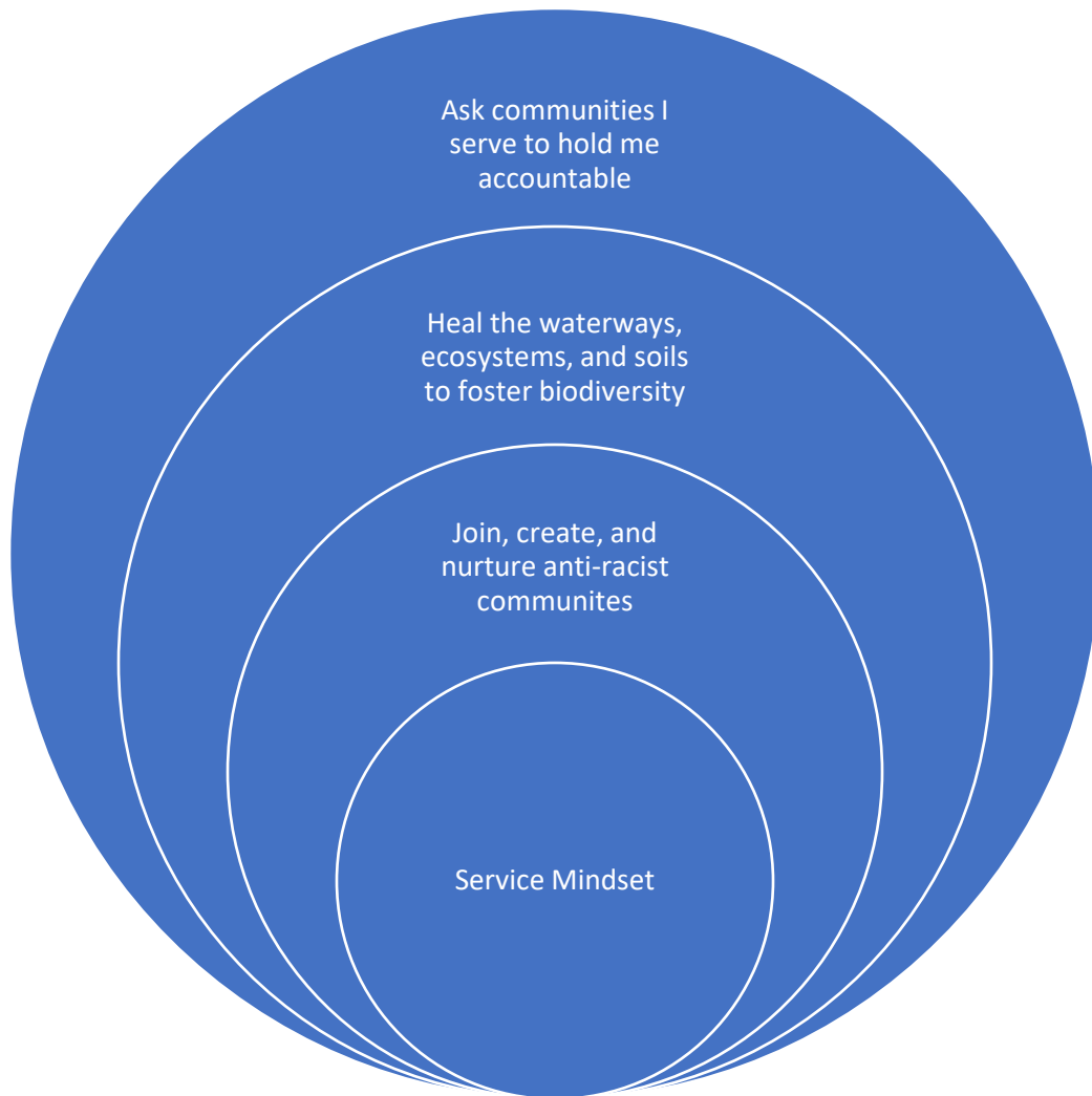
Figure 2: Roadmap of Service

A roadmap of service that seeks to turn from personal to societal liberation by building on the connected threads of service and healing. I chose a cyclical map to represent the ambiguous beginning and ending of this journey, as well as the interconnectedness of these actions.