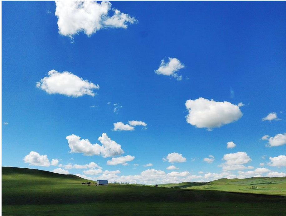
Fig. 2: Hulun Buir Grassland

the running horses, the blooming wildflowers: all of these constitute a beautiful picture scroll. Hulun Buir is indeed worthy of the title as the best and the most beautiful grassland in China.