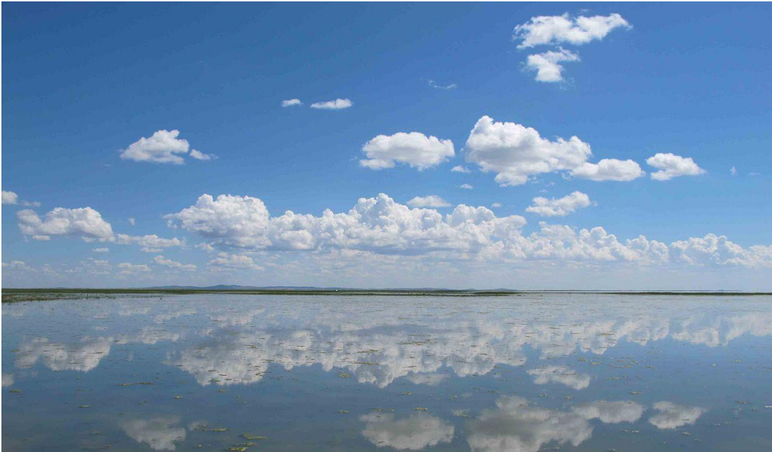
Fig. 4: Hulun Lake