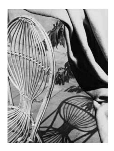
Florence Henri Untitled (Mirror Composition), 1933

Florence Henri Composition. Nature morte, c. 1933 Composition. Still Life