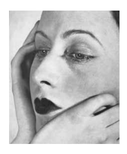
Florence Henri Portrait. Composition. Cora, c. 1930

In some areas, however, in spite of enormous promise and progress in thinking, change was slow. While questions of suffrage, family and domestic life, work and wages, were being debated in nation states throughout postwar Europe, and while in some cases women's suffrage was achieved, progress was far from uniform. The economic depression of the 1930s did little to help the situation. Then, as now, women bore the brunt of the financial downturn. In France, the new woman in search of economic, political, cultural and sexual liberation, built up by the media in the 1920s, was subsequently frowned upon, by the same commentators, for her decadence. Pro-natal campaigns were