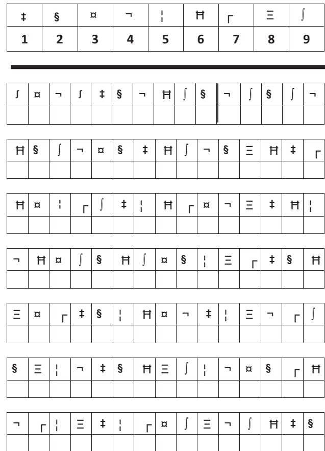
Figure 1. Example of stimuli of the SDMT type.

The SDMT 19 was recommended as the test of information processing speed. The test consists of single digits paired with abstract symbols (Figure 1). Rows of the nine symbols are arranged pseudo-randomly. The patient must say the number that corresponds with each symbol. The SDMT can be completed within 5 min, including instructions, practice and testing. The good psychometric properties of the SDMT are well described. 23 The SDMT has a reported sensitivity of 82% and a specificity of 60%. 24 It has validations in several countries. 2,24-26 Estimates of practice effects and change indices are available. 27 The SDMT has a high sensitivity to cognitive impairment in MS. 6,26,28 It has been shown to be the best predictor of MS cognitive impairment in both the BRB-N and MACFIMS. 6 The SDMT is reliable when administered by nursing staff over several months, with minimal practice effects (0.2). 29 There is also evidence for the sensitivity of the SDMT to cognitive change in MS. 2,25,30 The SDMT is well validated against both conventional brain MRI parameters (including atrophy, 31 brain parenchymal fraction (BPF) and third ventricular width, 32 atrophy at baseline predicting SDMT change; 33 cortical lesion number and white matter lesion volume, 34 cortical lesion volume, 32,34,35 cortical lesion