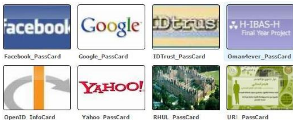
Fig. 2. PassCards

Prior to, or during, use of the CPM, the user invokes the CIdS and creates a PassCard, inserting their username in the firstname field and password in the lastname field. Optionally, the user could also insert the URL of the target website in the webpage field 6 (see Sect. 3.2). For ease of identification, the user can give the PassCard a meaningful name, e.g. of the corresponding website. The user can also upload an image for the PassCard, e.g. containing the logo of the intended site. Example PassCards are shown in Fig. 2.