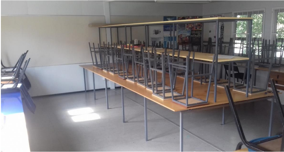
Figure 5-The science lab (space arrangement)

In my observation I found that the working space at the lab is not sufficient as stipulated by The Norms and Standards for PDIs and DTDCs (2015). The size for each teacher for training laboratories should be 1.5 m 2 to 2m 2 (BDE, 2015). See Figure 6.