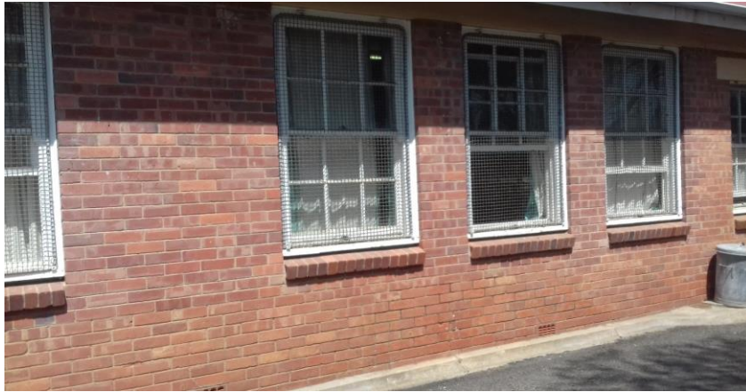
Figure 2- The windows with burglar guards for safety