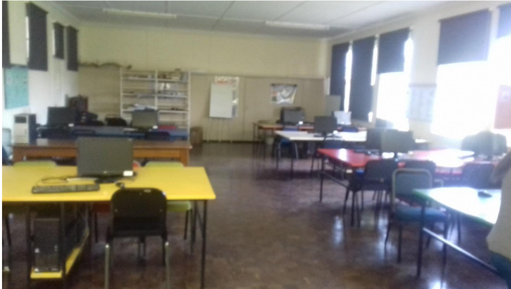
Figure 4-The computer laboratory

for about a hundred people. There is a computer laboratory with twenty-four (see Figure 4) computers which have access to the internet for most of the time. The number of computers that are there is appropriate because the policy states that there should be twenty to thirty teachers being trained at a time for science and ICT laboratories.