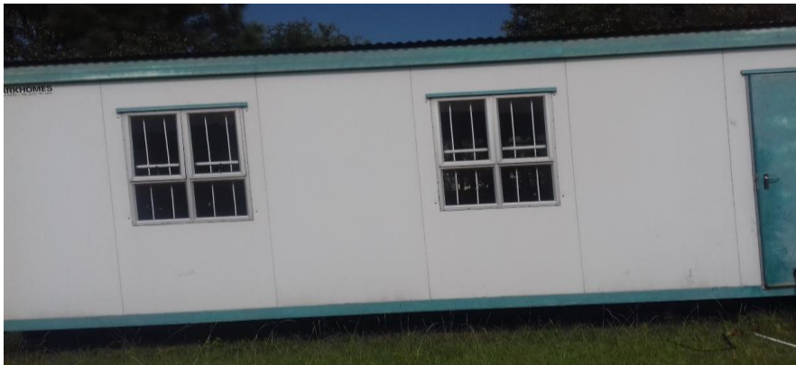
Figure 3 The mobile laboratory

In the centre there are three stable buildings and two mobile buildings of which one is used as the science laboratory. See Figure 3.