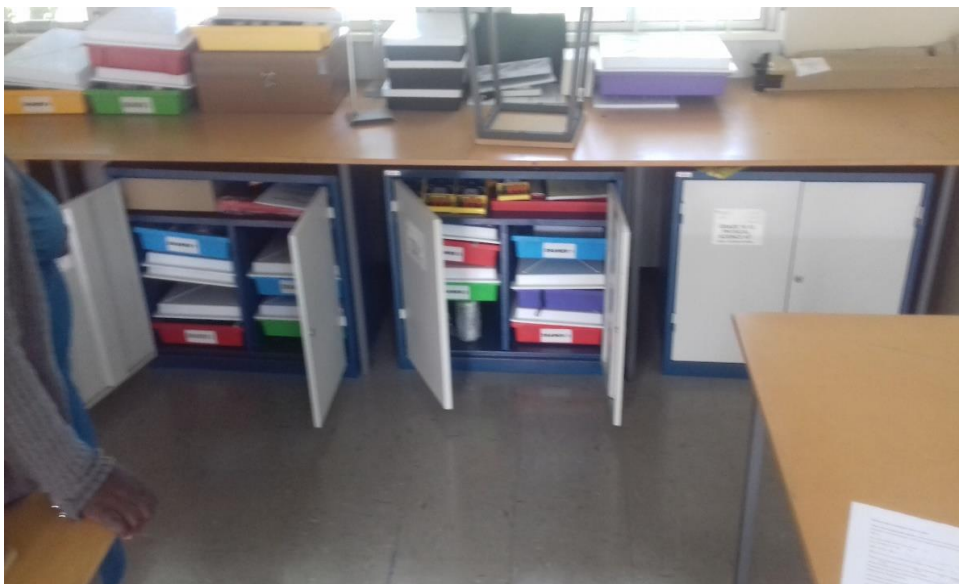
Figure 6- The lockable cupboards for science kits

In my observation I found that the working space at the lab is not sufficient as stipulated by The Norms and Standards for PDIs and DTDCs (2015). The size for each teacher for training laboratories should be 1.5 m 2 to 2m 2 (BDE, 2015). See Figure 6.