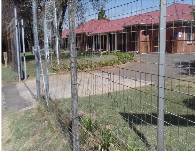
Figure 1 The main gate and fence of the centre

At the gate there is a security shelter but what I noticed during my visits was that the security guard was sometimes not available. When I asked the manager she said that the security contract was not renewed by the Department. This does not agree with the policy which says that a security guard arrangement has to be put in place as a safety and security measure.