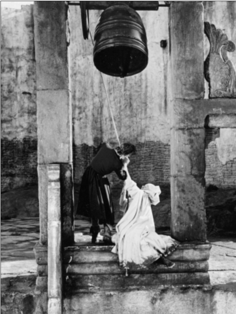
• Black Narcissus : Calling the imperialist civilising mission into question.

intellectual superiority and in ensuring that Indian subjects would work for, and not against, their imperial masters. While the value of