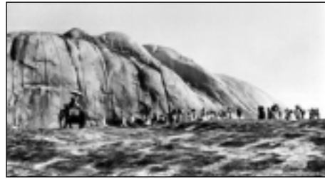
• A Passage to India (Lean, 1984)

Anne Beezer also suggests that while irony may take on the guise of 'an analytical, "deconstructive" mode' in the way in which it deflates the pretensions and high-mindedness of heroic imperial discourses, it is also typically 'conservative in its operations', implying that 'if a long enough view is taken, all current events and individual dramas are insignificant in the face of the "immensity of life"'. 23 It is also this sense of the transience of human actions in the face of the 'immensity of life' that underpins the film's deployment of irony and hysteria in response to the ultimate 'unknowability' of India. For Said, a key feature of orientalism is not simply its construction of the East as 'absolutely different' but as 'unchanging'. 24 In Black Narcissus this