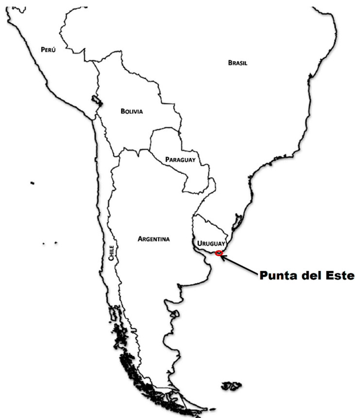
Figure 2. Geographical location of Maldonado-Punta del Este.

The sample was obtained by personal interview, while sampling for convenience but controlling various socio-demographic parameters to avoid significant biases in the resulting profile. The information was collected between February and September 2016. We carried out the field work over several months to avoid biases due to the seasonality of tourist activity. The questionnaires obtained were reviewed to verify that they were not incomplete or poorly answered. If any of these problems were detected, the questionnaire was discarded. The final sample consisted of a total of 420 valid questionnaires, in which the demographic parameters were tested to avoid bias. Table 1 shows the socio-demographic profile. The margin of error is of 4.88%, with a 95% confidence level. This investigation uses a causal model, in which responses are collected using a 5-point Likert scale (1 “totally disagree” to 5 “totally agree”). These scales come from previous studies and previous work of the authors [5,75,81,83,129–131,136,137].