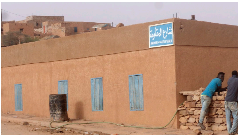
Figure 2. Avenue de la Résistance, Rachid, Mauritania

Attempting a reading of the region’s colonial past, one cannot overlook recent events in neighboring Senegal. In contrast to events in Mauritania—where the Um Tounsi’s memorial plaque has not been rehabilitated and the whole monument is today practically in ruins—in Senegal the statue of the former French governor of the colony, Louis Faidherbe, initially erected in 1886, was restored to public space in 2017, with the inscription: “To its governor, L. Faidherbe, Senegal is grateful.” In fact, the Senegalese government ordered the mayor of the city of Saint-Louis to repair Faidherbe’s statue after strong gusts of wind toppled it from its pedestal in September 2017. This episode has raised intense debate, with opinions in some cases declaring that this “was the perfect opportunity to get rid of it once and for all” and others arguing that Faidherbe was “the creator of modern Senegal and the liberator of black Senegalese facing the exactions of the Moors.” 8