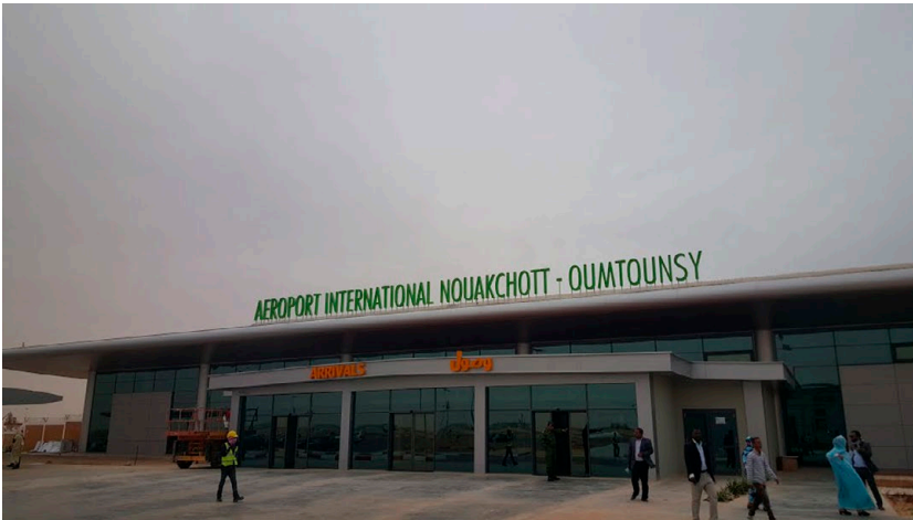
Figure 5. The new Nouakchott international airport, named after the battle of Um Tounsi