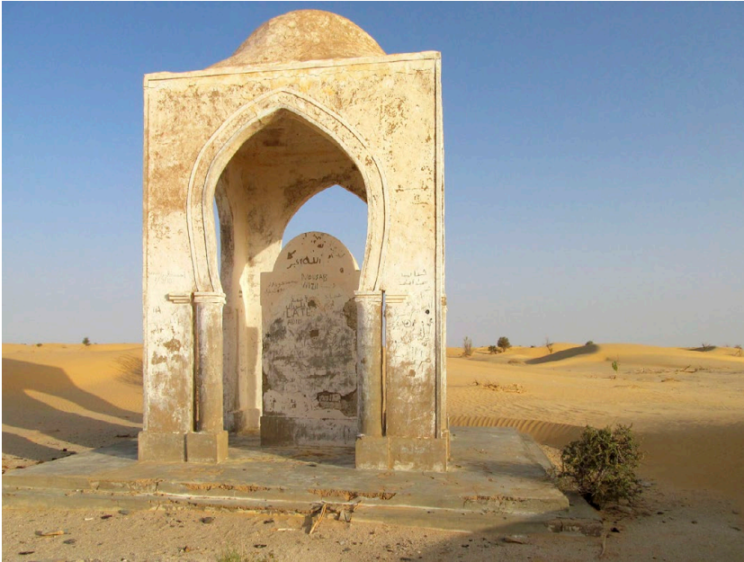
Figure 1. Um Tounsi's colonial monument 80 kilometers north of Nouakchott

intricacy and pervasive character of this historical period, a century after the implementation of colonial rule and more than half a century after the country's independence in 1960, as the descendants of the Mauritanian participants of that colonial battle reenact this clash in the national parliament and in different media outlets. 1