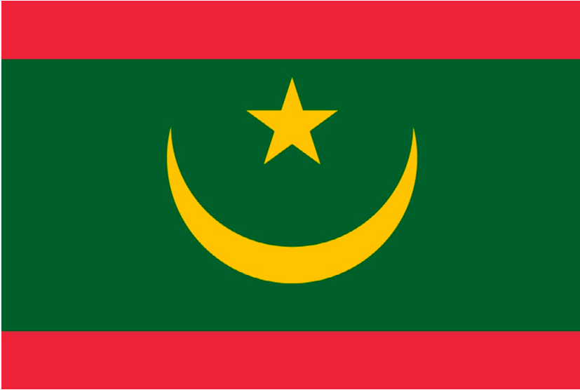
Figure 4. The current Mauritanian flag now incorporates 2 red stripes, symbolizing the blood of the martyrs of the resistance

and, probably more importantly, it made no reference to the resistance. Those opposed to this proposal reiterated that the religious character of the hymn was the best conceivable formula for uniting the entire country around the song. 31