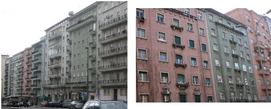
Figure 2 – Façades covered with colourful marmorite renders of Av. De Roma, Lisbon

Considering the period – middle 20th century – in which cementitious binders were already often used, both in structural elements and in coatings, and due to the darkening effect of fungi, soiling and pollution, there was a generalized belief in the technical milieu that these decorative renders were cement-based mortars. This belief was enhanced by the existence of an official specification document referring the use of a cement mix [3].