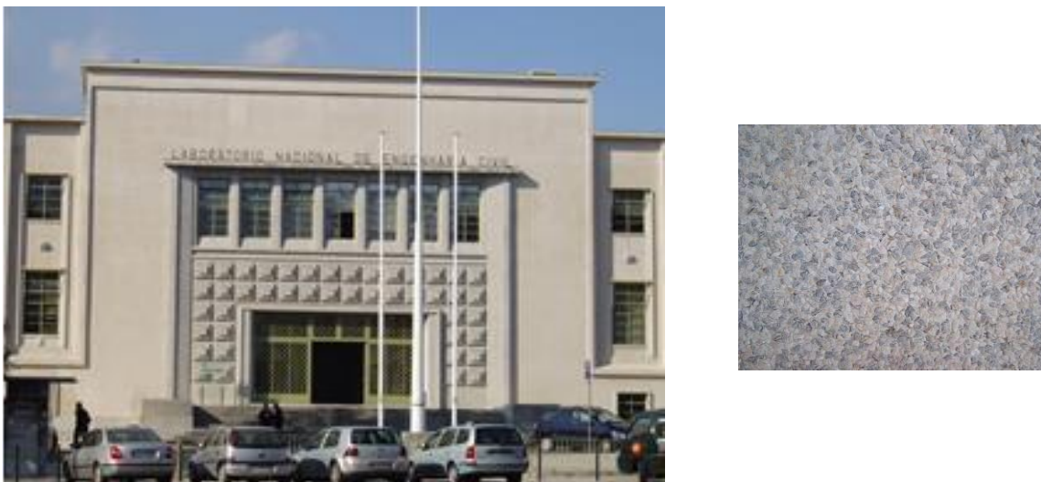
Figure 1 – Façade of LNEC main building covered with marmorite render: a) General view; b) Detail of marmorite

Being a very durable kind of render, after more than 5 decades, they show few anomalies, such as some cracks, stains and fungi and punctual erosion and lacunae (Figure 3).