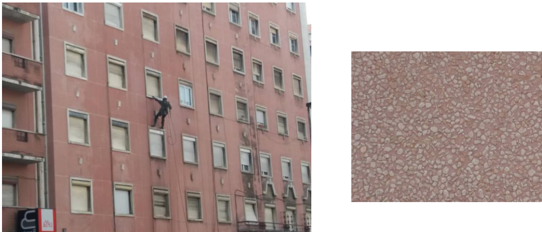
Figure 3 – Pink-red traditional marmorite render in Lisbon: a) General view during cleaning; b) Detail of red/pink marmorite

Revealing the materials and compositions used and highlighting the employed technique, this study aims at gathering information in order to allow the planning of suitable, compatible interventions and in this way contributing for the preservation of this characteristic decorative render.