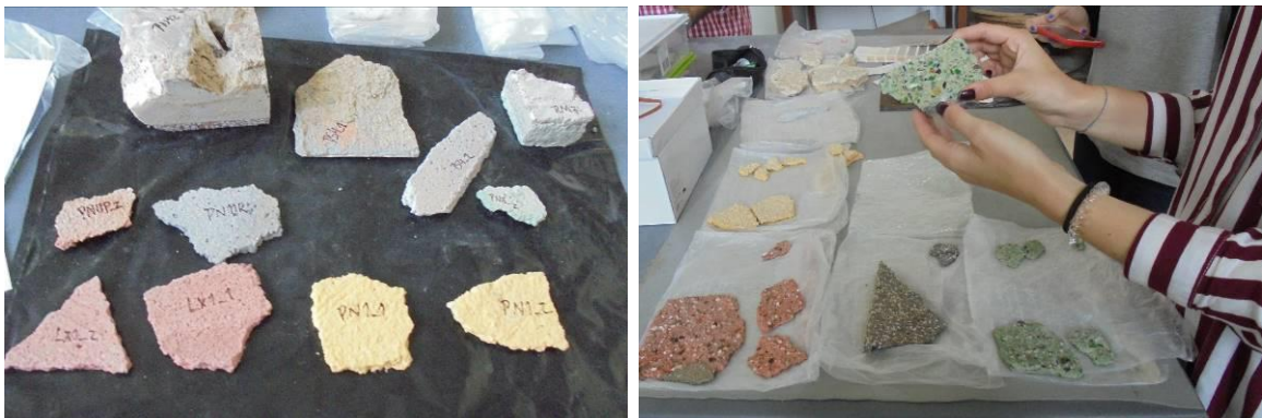
Figure 5. Samples of differently coloured marmorites collected