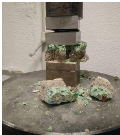
Figure 6. Physical and mechanical testing: a) Water absorption by capillarity; b) Compressive strength