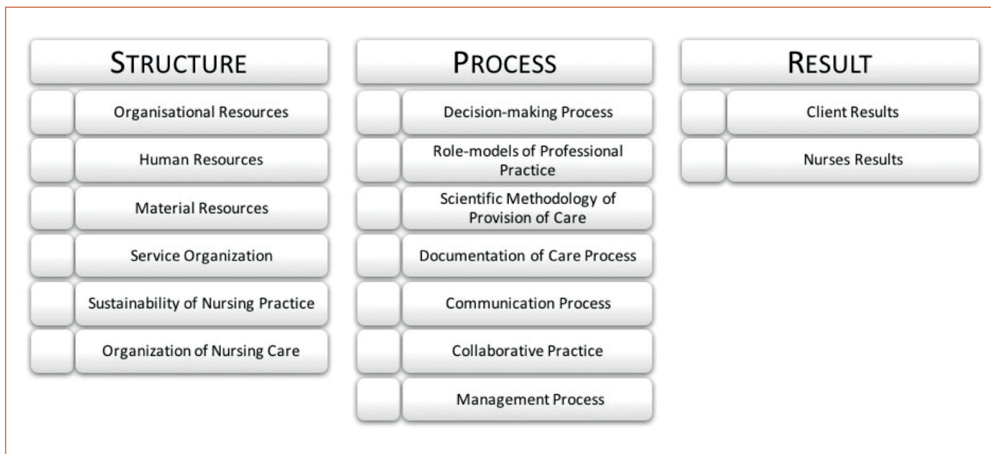
Figure 1. Categories of the “structure”, “process” and “result” components