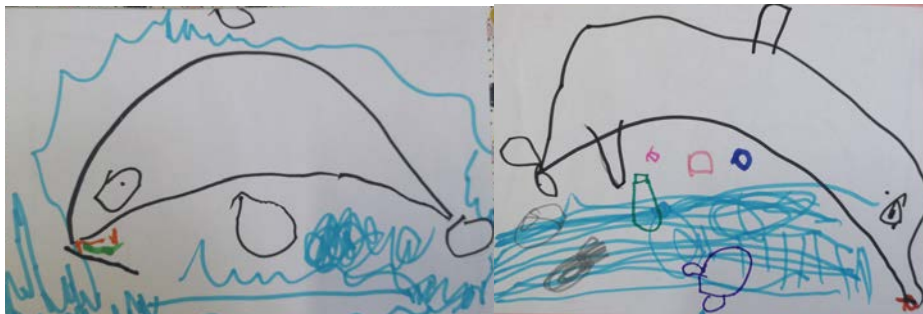
Figures 12 and 13. The whales seen by children in a sea without plastic and in a sea with plastic.

The data presented led us to better understand the reality of how young children are full social actors, competent to analyze the world in which they live and how they are aware of the problems that affect animals. The case of whales is an example that this awareness begins very early and it is real.