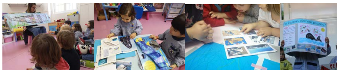
Figures 8, 9, 10 and 11. The steps of the project about whales.

Only in the nursery room (room D), attended by children of 2 and 3 years, a project on whales was developed, which emerged from the reading of a book ([8] Fernández, 2017). The question that immediately arose was: do whales eat people? In their research, the children found what whales eat, but they also found photographs where they saw whales died after the ingestion of plastic.