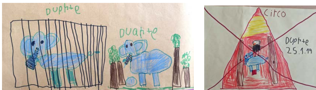
Figures 6 and 7. Animal rights seen by the children: the circus (Room C).

In room B and C the children identified animal rights from the knowledge that they have about their own rights as children. It is not unrelated to this fact that the discussion on children's rights is very present in the educational project of the College and in the practices and discourses of the educators.