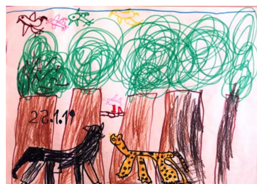
Figures 4 and 5. Two examples of children's drawings about the zoos (Room B).