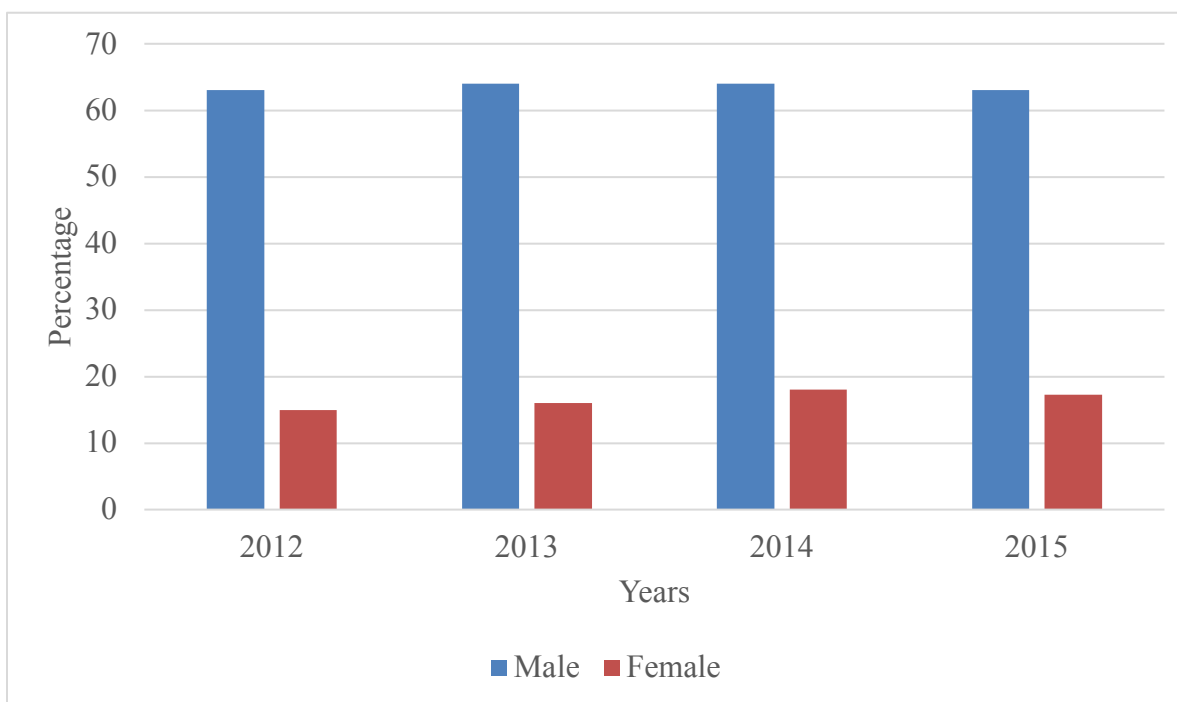
Figure 1. Labor force participation rates of Saudi Nationals from 2012 to 2015. Adapted from IMF Executive Board Concludes 2016 Article IV Consultation with Saudi Arabia (p. 36), by the International Monetary Fund, 2016, retrieved from https://www.imf.org/en/Publications/CR/Issues/2016/12/31/Saudi-Arabia-2016-Article-IV-Consultation-Press-Release-Staff-Report-and-Informational-Annex-44328 . Copyright 2017 by the author. Reprinted with permission.

Saqib, Aggarwal, and Rashid (2016) indicated that there is an essential positive long-standing association between females' empowerment and economic growth in the Kingdom of Saudi Arabia. Women make up almost 50% of Saudi population; however, their participation to the economic activity is low. Figure 1 clearly shows the labor participation rate for Saudi women, which has increased from 14.7% in 2012 to 17.3% in 2015.