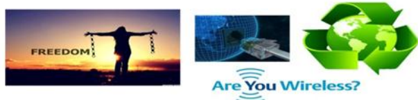
Figure 3. Five phases of David Passig [2]

FOURTH DIMENSION -Individual Technology focused production