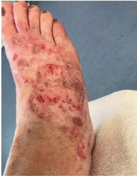
Fig. 1. Violaceous, haemorrhagic and scaly erythematous skin with deep sores. Right foot.