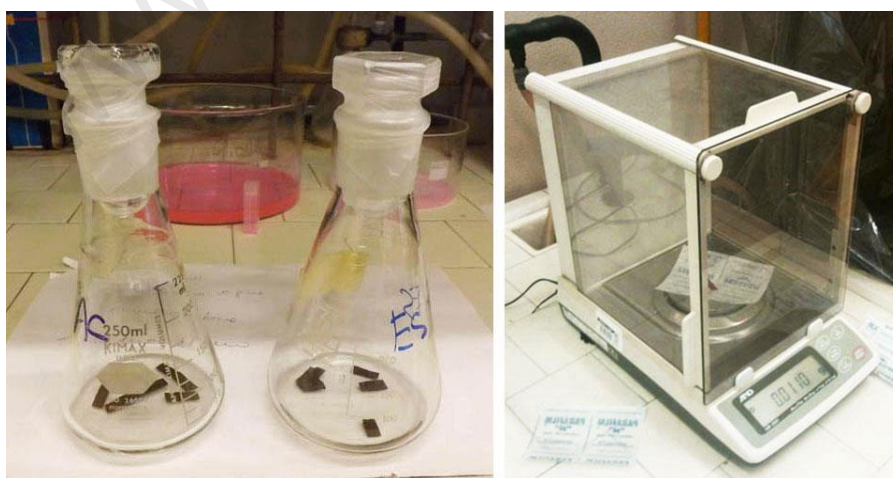
Figure 1. Tape samples ready for incubation (left); precision weighing balance (0.0001 g) used to weigh the samples before and after incubation.

In line with the spirit of Open Science, in this article we present the results obtained during the replication of the test conducted in 2006 and we plan future analyses to gain insight in the unexpected results (see Sec. Conclusions). The research agenda mentioned in the previous paragraph also embraces this spirit, in its methods and goals, i.e. scientific literary work and shared knowledge bases.