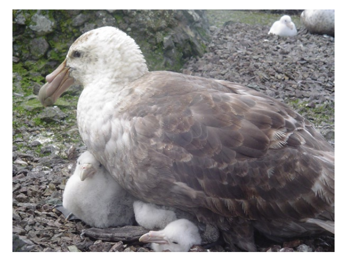
Fig. 1. Female of Macronectes giganteus and both chicks.

It has been suggested that parents might differentiate their offspring by their physical appearance (Miller & Emlen 1975). Although feeding sessions were not observed, the native chick and the adopted chick were raised successfully at first, but after the third week of adoption, we observed aggressive behaviors between the chicks,