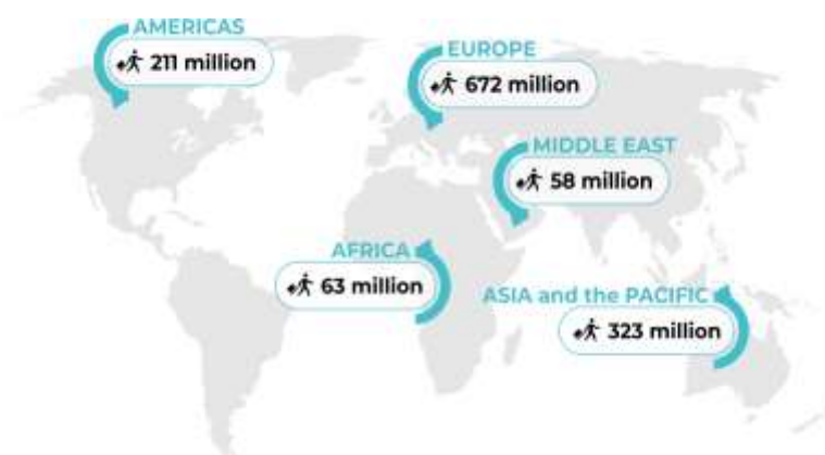
Figure 1 Annual number of foreign tourists in 2019 by region

Tourism is an active vacation that affects the promotion of health, the physical development of a person, associated with movement outside the boundaries of a permanent place of residence. Important factors affecting the development of tourism have become the development of transport, communications, comprehensive mobilization, concentration, and the growth of public welfare. In these conditions, the socio-economic position of tourism is rapidly strengthening. Its share in world trade in services is already more than 30%. In the world market, the tourist product is leading along with oil. In many countries of the world, tourism is the main sector of the economy. Tourists are attracted by natural, historical, cultural and religious monuments, a favourable climate, magnificent beaches, a stable political and social environment. The main region of international tourism is Europe, which accounts for 672 million tourists, 323 million to the countries of the Asia-Pacific region, and 211 million to North and Latin America (Fig. 1).