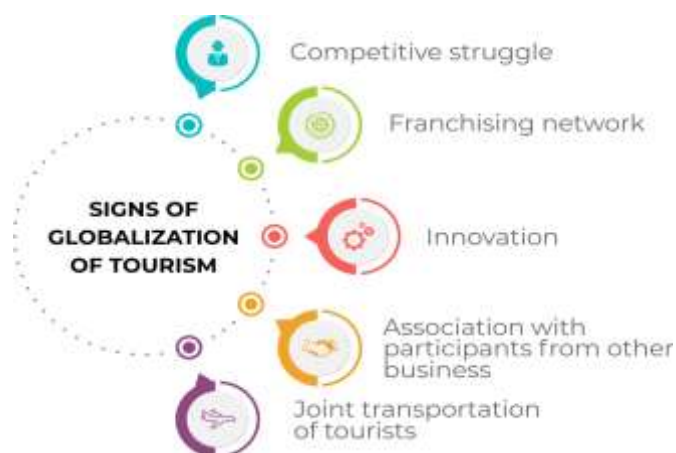
Figure 2 Signs of tourism globalization

The globalization of business within the framework of a tourism organization contributes to the formation of a strong competitive position in comparison with competing organizations.