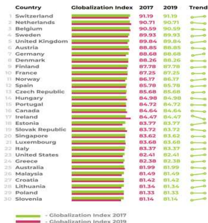
Figure 3 Top 30 countries in the Globalization Index 2019

The impact of globalization of international tourism on the development of international relations