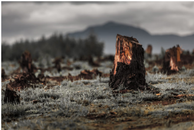
Deforestation caused by agricultural expansion in Madagascar

Climate-related land degradation is expected to have net negative impacts on agricultural productivity in most parts of Africa and alter the regional suitability of various crops, leading to an overall negative impact on food security. Estimates show that past erosion in Africa has caused yield reduction of 2–40%, and that if present trend continues, the yield reduction by 2020 may be 16.5%. In the southern region of Africa, large areas of Angola, Mozambique and Zambia have been deforested. More specifically, 13% of the farmland in Zambia is severely eroded due to exposure from deforestation. In Zimbabwe, the extent of the cultivated area and the intensity with which it is farmed or grazed has left 10% of communal land seriously eroded. In the Sahel, land degradation is estimated to cause a 3% per annum decline in agricultural production, seriously compromising food security in light of high population growth (Doukkali et al. , 2018). In Senegal for example, agricultural expansion, particularly groundnut cultivation has led to a decline in fallow land and savannah vegetation.