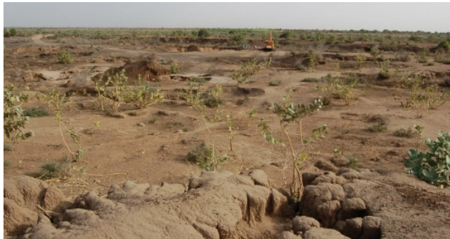
Badly degraded land. Experts say nearly 65 per cent of Africa’s land is under threat even as the continent’s food imports exceeded its exports by 30 per cent.

arid, semi-arid and dry sub-humid zones only 3 to 30.6 % of lands are non-degraded (very low to low), in the sub-humid and humid zones the non-degraded lands cover around 38.1 to 47.2%. In the highland areas, almost 84 % are degraded at a severity ranging from medium to very high.