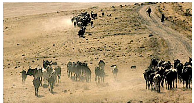
Herders migrating with livestock.

There is increasing poverty levels in drylands of Sub-Saharan Africa where 41% of the total population live in extreme poverty. For eastern Africa, both recent droughts and decadal declines have been linked to human-induced warming. There is high confidence that many oases of North Africa are