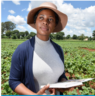
Trials of drought tolerant beans in Malawi, which is suffering from its worst drought in three decades