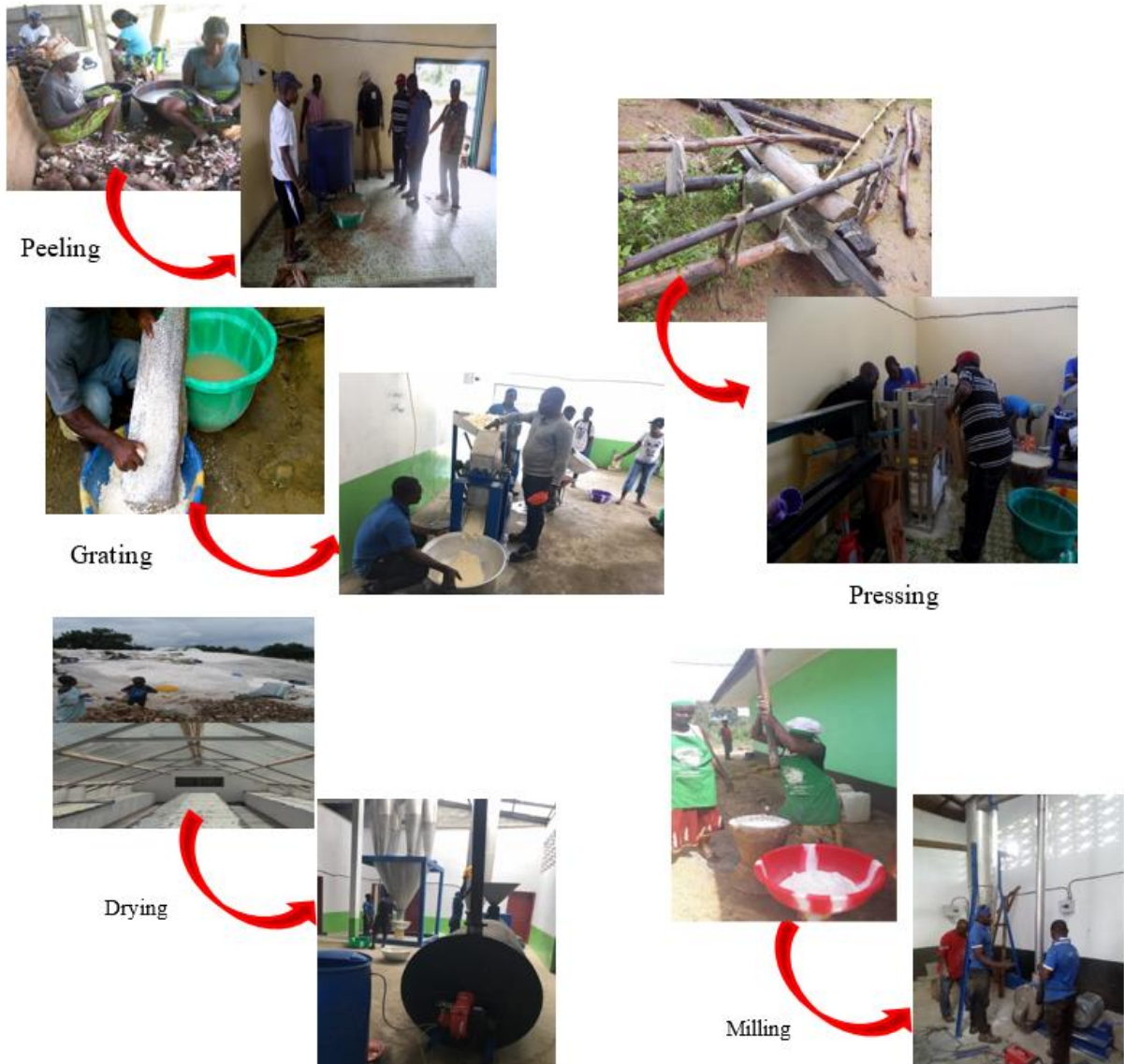
Fig 1. Upscaled cassava processing equipment in Liberia

to replace the use of the pestle and mortar, and weighing machines for weighing fresh roots during procurement and final products during packaging, which were not done prior to the project intervention. The flash dryer will replace the use of flat rocks, tarred roads, and bare floors with or without the use of polyethylene sheets for drying cassava products (Fig. 1).