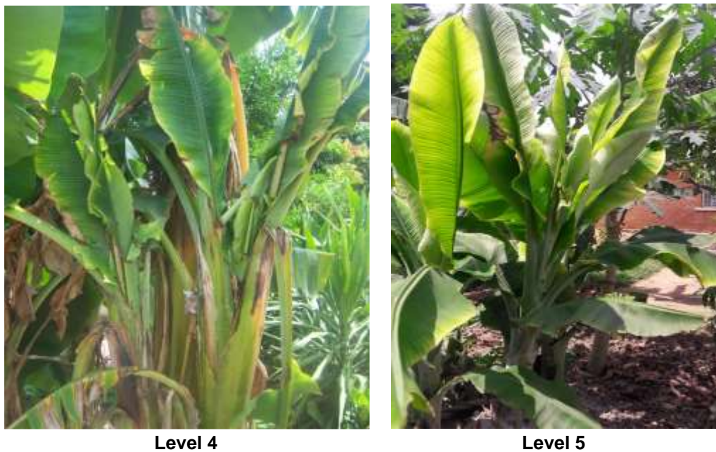
Figure 2. Typical banana bunchy top disease symptoms.