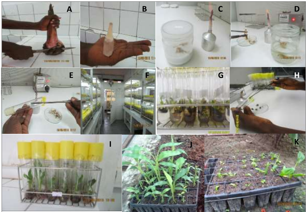
Figure 3. Stages of cultivation. A: Removal of all old non-meristematic tissues. B: Explant with reduced size and washed under running water. C: Disinfection successively by immersing the explant in alcohol 70% for 15 s, and the solution of calcium hypochlorite 30% for 20 min. The explant is then rinsed with sterile distilled water three times. D: Removal of the foliar tissues one after the other until extraction of the meristematic apex. E: Putting the explant in the in vitro culture medium. F: Transfer of tubes containing the explants into the culture chamber. G: Proliferation of the buds after a minimum of two weeks. H: Subculture (separation of buds and their transfer to a new medium). I: Regeneration of buds to rooted seedlings. J and K: Transfer of vitro plants to pots.