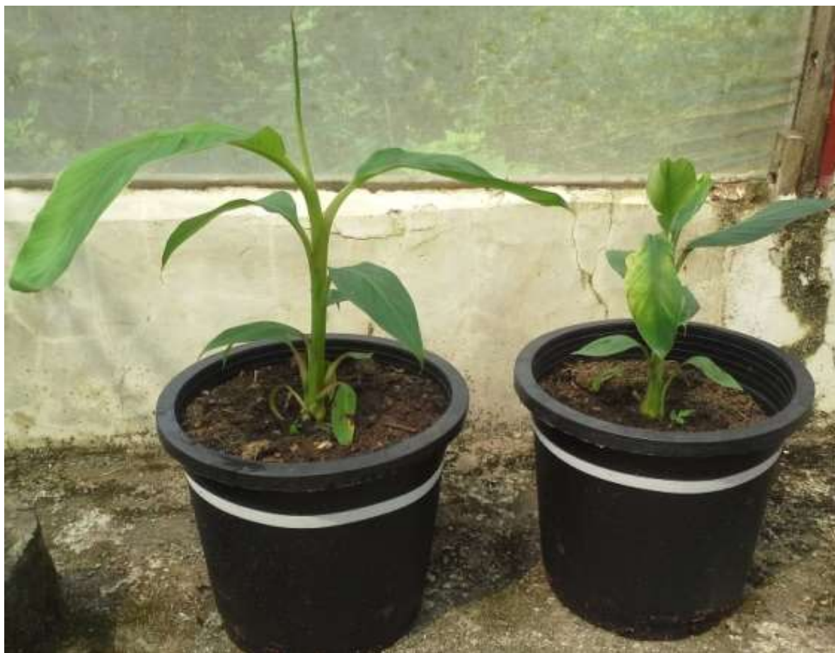
Figure 5. Banana bunchy top virus-free plantlet (left), and infected plantlet (right).

plantain and 1.86 for banana. Our results are also in line with Dheda (1992), who showed that 10 \mu M BAP increased the proliferation rates in in vitro with 3.5 for the plantain cultivar Three Hand Planty ( Musa AAB) with 18.6, 12.4 and 21.4 for the cooking banana cultivars Bluggoe, Cardaba and Saba ( Musa ABB) and 7.1 for the dessert banana cultivar Yangambi Km5 ( Musa AAA). Roels et al. (2005) obtained a proliferation rate of 3-5 in the dessert Cavendish (AAA) subgroup. The virus detection by TAS-ELISA showed that 73.3% of Litete and 66.6% of Libanga Likale were found to be BBTB free after plant regeneration. Our results are in line with Morel and Martin (1952), who by taking meristematic spikes of dahlias obtained dahlias free from the mosaic of dahlias and the spotted wilt virus which are caused by RNA