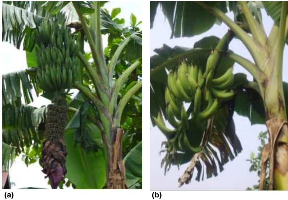
Figure 1. Cultivars used for in vitro culture (a) Litete and (b) Libanga Likale.