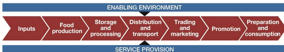
Figure 1 Stages and influencing factors in a food value chain

The expression “from farm to fork” is often used to describe food VCs, as they typically take the commodity from production to consumption (see Figure 1). Transformations in food systems have led to different types of food VCs in developing countries, ranging from traditional VCs (smallholder farmers selling to traders and local markets), to modern VCs (food manufacturers sourcing from commercial farmers and selling in supermarket outlets) to combinations of these two (multinationals selling through networks of traditional traders or sellers, or supermarkets sourcing from smallholders) (Gómez and Ricketts 2013). In all cases, a VC is commodity and even product specific. A specific VC also serves a specific market, which can be local, domestic or international.