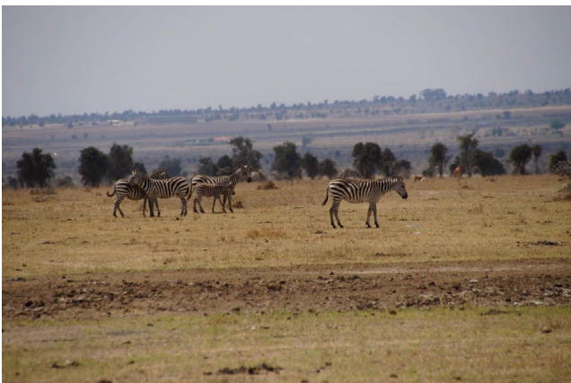
FIGURE 2 Wildlife on Kapiti Ranch of the International Livestock Research Institute, ILRI, south of Nairobi, Kenya

African soils in general have great potential for storing SOC, provided that appropriate land management practices and carbon input measures are undertaken (Solomon et al., 2015). In Ethiopia, agricultural production and land productivity remain low, due to ever-increasing human population pressure on land resources, in combination with unfavorable land policies (small land holdings and land ownership issues). Shiferaw, Hurni, and Zeleke (2013) report some success for the Ethiopian Sustainable Land Management Program (SLMP), which aims at improving soil quality and productivity by restoring degraded lands, including grasslands, using best land management practices and climate change mitigation and adaptation measures ( https://