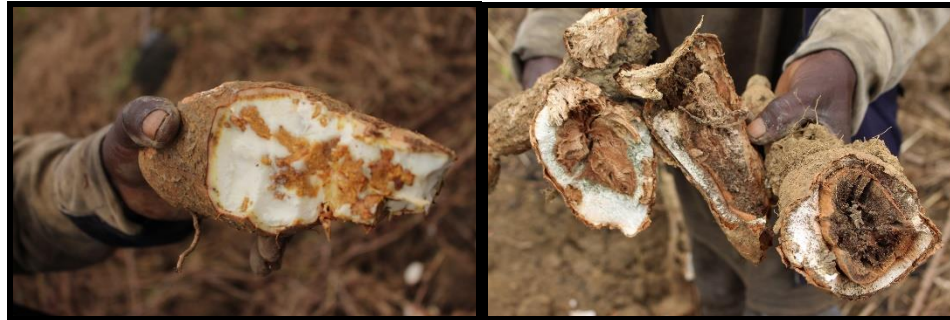
Figure 1: Severe cassava root necrosis due to CBSD-like at INERA- Mvuazi research center.

Several attempts to identify the causative agent responsible for CBSD-like disease in western in DRC have been undertaken since 2004 using cassava leaf samples, including those from plants showing very severe symptoms, with no success to date [18].