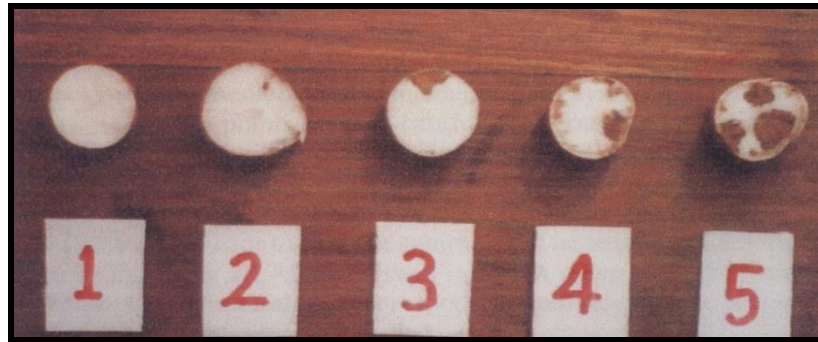
Figure 2: Root necrosis severity scores

The first trial was established according to the split plot experimental design with variety as the main factor and the cuttings phytosanitary state as a secondary factor, in three replications. The elementary plot was 5m x 10m.