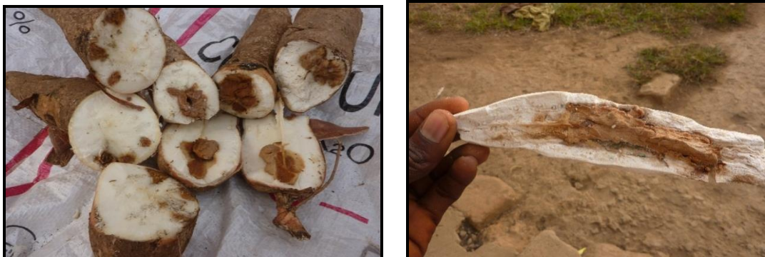
Figure 1. Typical CBSD-like root necrosis as observed in northern Angola (in fresh and dry roots)

Incidence = (number of diseased plants) / (number of plants observed) x 100.