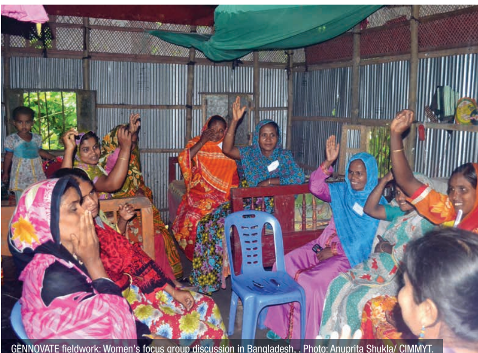
GENNOVATE fieldwork: Women's focus group discussion in Bangladesh.

In some communities husbands and the wider family do not allow women to interact with male extension workers. Measures to overcome resistance include locating training events close to women's homes in order to facilitate their participation. Involving men and other relatives in discussion processes around the benefits of women securing training in field crops, even when they do not work in the field, is important. Appointing a woman facilitator and training women on their own can be a useful strategy as well.