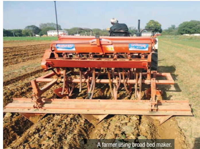
A farmer using broad bed maker.

with some land are excluded through their gender and low-income status. The majority of such women and their husbands are unable to meet the minimum targeting criteria for training in wheat-maize innovations. The local partner organization stipulated that participating farmers should farm at least 20 decimals (.08 hectares), whether owned or hired in. Potential participants also needed to have a minimum level of education. These criteria automatically exclude most low-income women and men, the majority of whom have never been targeted by the rural advisory services. At the same time, poor women and men expressed a strong desire for inclusion.