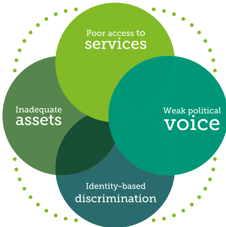
Figure 1. Structural drivers underpinning marginalization processes.

The Santal people in Bangladesh score very low on multiple indicators. One study conducted in six villages showed that over a period of 50 years the number Santal families holding more than 15 acres (6 hectares) of land diminished from 72 to 0. The Santal are “losing their existence with regards to their economic, social, and political lives” and now work as day laborers on the land they previously owned (Rahman and Bhuiyan, 2009; see also Brandt, 2011; Uddin, 2009; Barkat et al. , 2009 for similar findings). However, ethnic Bengali and indigenous women, including Santals, have a long history of active militancy and passive resistance to land expropriation, for example for mining, and in favour of more equitable sharecropping arrangements (etc.), in Bangladesh over many decades (Alam, 2015; Harrington, 2013; Priyadarshini, 2012) and are active in the Bangladesh Adivasi Forum, the Bangladesh Indigenous Peoples Forum and as members of the Citizens Platform for the SDGs ( http://bdplatform4sdgs.net ). The Citizen’s Declaration 2017 has a special focus on LNOB (Citizen’s Platform for SDGs, 2017).