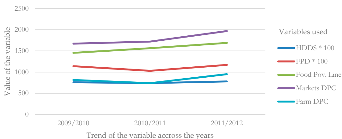
Figure 2. Trends of key variables. HDDS (household dietary diversity score) and FPD (farm production diversity) were multiplied by 100 for proper scaling. DPC is daily per capita consumption.

In Figure 2, we presented trends of key outcome variables. Notably, farm production diversity (FPD) followed a similar trend as that of household dietary diversity score (HDDS). Both farm and markets' daily per capita expenditures also followed closely similar trends. All these four variables had slight decreases in 2010/2011 before a rise in 2011/2012. The trend for the food poverty line was instead steadily increasing. However, the food security trend (Table 1) showed an upward spike during 2010/2011, the year when FPD and HDDS showed downward spikes.