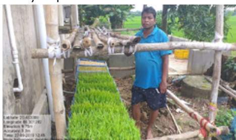
27 September 2019, Hydroponic at Harianka, Derabish, Kendrapada