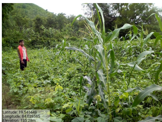
Date: 19 August 2019; Crop: Cowpea; Name of farmer: Daka Gouda; Village: Kerikerijhola; Block: Sheragada; District: Ganjam