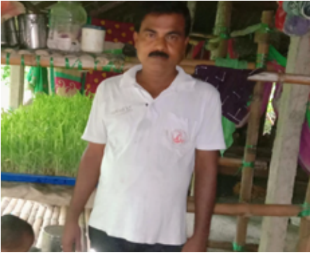
23 September 2019, Hydroponic at Barondua, Basudevpur, Bhadrak