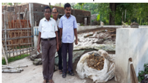
08 August 2019, Silage at Barondua, Bhadrak