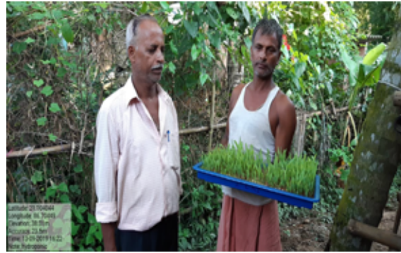
13 September 2019, Hydroponic at B. Binayakpur, Bhadrak