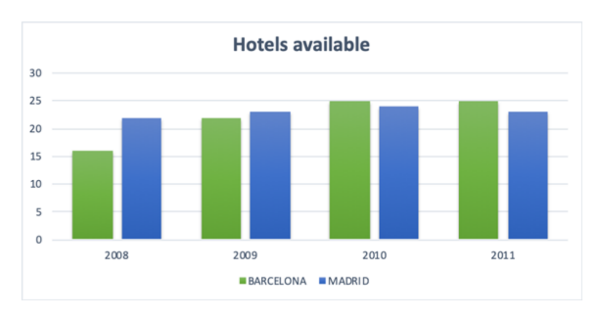
Figure 3. Hotels available in the cities of Barcelona and Madrid. (INE database and websites of the cities of Barcelona and Madrid)