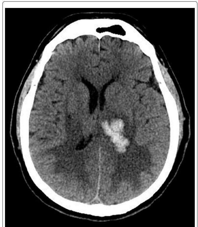
Figure 1: Cranial computed tomography scan: left thalamo-capsular hematoma (38 cm max) with surrounding edema and mass effect upon the left lateral ventricle.

A 49-year-old man with refractory hypertension was admitted to our hospital because of hemorrhagic stroke. Glasgow Coma Scale was 9 and Norton Scale 8. The patient was intubated for controlled mechanical ventilation. Cranial Computed Tomography (CT) scan revealed a left thalamo-capsular hematoma with surrounding edema and mass effect upon the left lateral ventricle (Figure 1). He presented with oliguria (urine output 300 mL daily, creatinine 2.45 mg/dl).