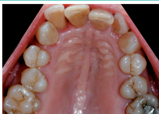
Figure 5 Occlusal view of the upper arch (t0).