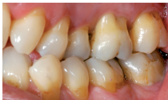
Figure 4 Lateral view left (t0).