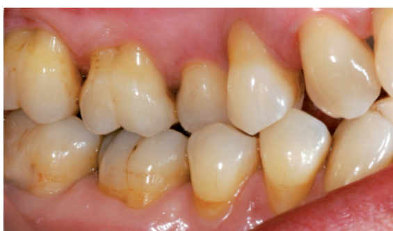
Figure 3 Lateral view right (t01).