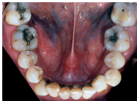
Figure 10 Occlusal view of the lower arch after treatment (t1).