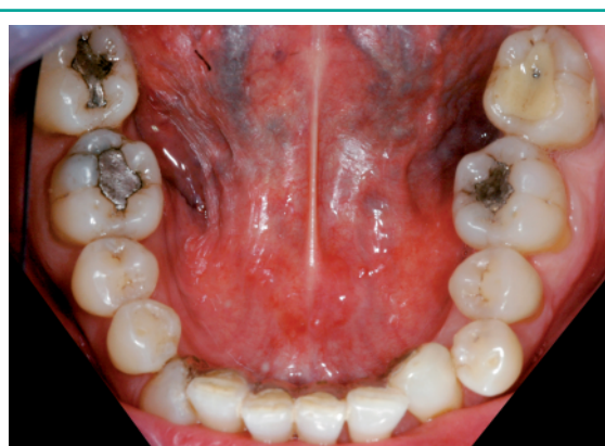
Figure 6 Occlusal view of the lower arch (t0).

covering the space through an interproximal reduction of the the front area of the canines. An intrusion of 1.1 and 1.2, reduction in overjet and rotations of 1.3 and 2.3 (Figs. 8, 11).