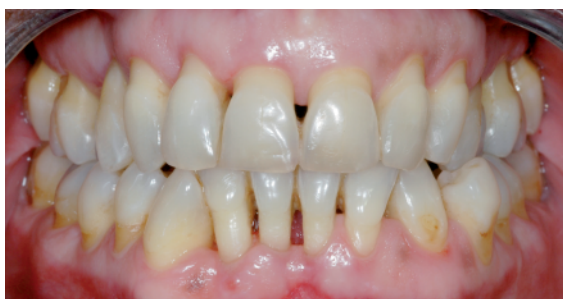
Figure 8 Frontal view after treatment (t1).