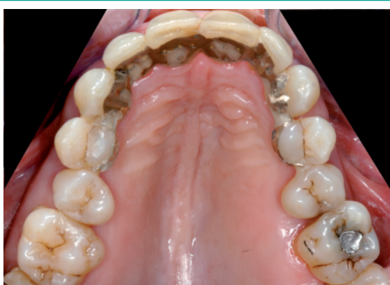
Figure 9 Occlusal view of the upper arch after treatment (t1).