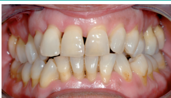
Figure 2 Frontal view (t0).