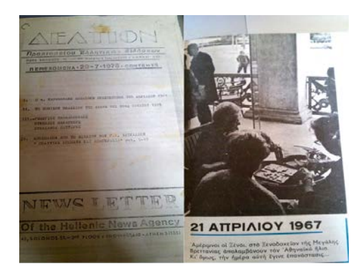
Figure 1. "From the Flea Market," newsletter published by an Anglophone news agency created by the junta's supporters to cover the protaitioi trials (left) and propaganda brochure depicting tourists "enjoying the Athenian sun" on the day of the coup d'état (right).

productive period from which to consider issues of global and theoretical significance. For the most part, oral history, archival research, and ethnography are largely absent—a telling void if we take into account the great availability of materials in municipalities and cultural and professional associations (not to mention flea markets!), as well as the opportunity that scholars had to engage the former dictators or even lesser junta officials in a comprehensive study of the military regime (Figure 1).