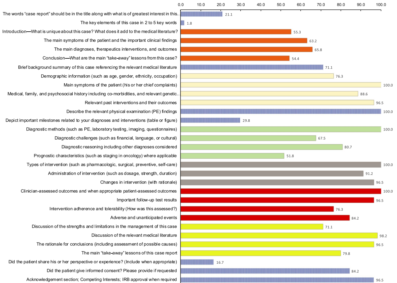
FIGURE 2 Completeness of reporting (COR) score of the included case reports detailed by items of CARE statement