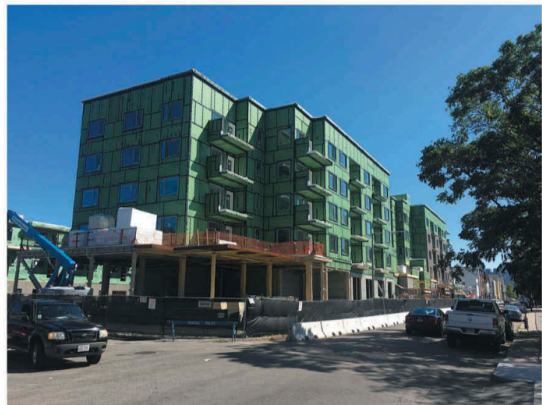
Figure 1a, 1b, 1c, 1d:

Overall title: "Boston: New green and play spaces and adjacent high-end condominium development in East Boston"