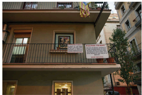
Figure 2a, 2b, 2c, 2d:

Overall title "Barcelona: New green and play spaces and protest against mass tourism and gentrification in Ciutat Vella"