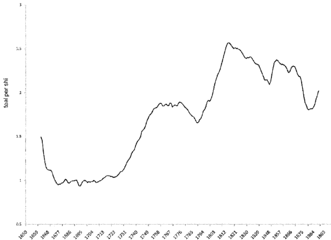
FIGURE 1.1 GRAIN PRICES IN THE LOWER YANGZI DELTA, 1650–1900 (TAELS PER SHI, TWENTY-FIVE-YEAR MOVING AVERAGE)