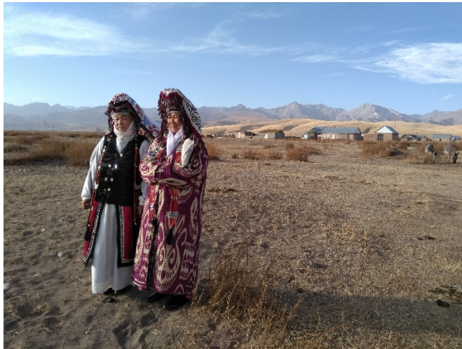
Above, members of the weaver's collective in Sary-Mogol

business around the resurrection of ancient craft practices, such as traditional women's clothes and yurt band weaving. The items the group make are based on scientific and historical research and have been presented in fashion shows in Alai and Osh. They have also published a catalogue funded by the Institute of Strategic Sustainable Development using photography provided by a local company. One of the elder daughters associated with the collective is a university teacher at Osh State University and a PhD researcher in traditional knowledge. They mentioned that they produce stories about the local area to enhance the value of the items they make.