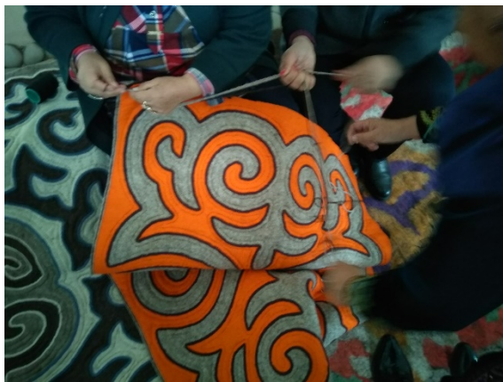
Traditional felt carpet making, Bishkek