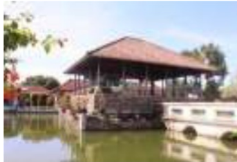
Figure 1. Bale Kambang seen from the west

Kerangasem there are three buildings, namely Maskerdam building (main building), Bale Pemandesan, and Bale Pawedan. Naming of Maskerdam building is an adoption of the name of Dutch city that is Amsterdam. The building has banjah (wide front porch) such as bale daje building on housing in ancient Bali that has wide terrace. The building consists of three main doors, on the westernmost entrance at this time as a place of entry which has a king seat display. The eastern door of today as the entrance to the king's retreat is marked with a bed fitted with a mosquito net. While the middle door as a place to enter the middle room that connects the rooms behind the other including to go to the king's kitchen space located at the back of Maskerdam building. This Maskerdam building is the place to receive important king guests in the Dutch era (figure 2).