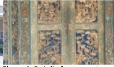
Figure 3. Detail of ornaments on door in Maskerdam building

In this main building found ornaments that display Chinese style as found in the ornaments of doors and windows. The motives that are displayed as well as the style of carving on the door leaves tells the style of China, so it looks to be different compared to the ornament of door leaves in general in Bali. If observed at a glance there will be no difference, because the appearance has a resemblance to the Bali style door leaf. Conversely, if observed in detail the difference will be apparent. The carving tells the stories from China with a distinctive Chinese style identity with very good quality, neat and very high complexity. So overall the ornament was able to display a unique impression, because it displays the difference with the style of door ornaments in general in Bali. On the walls of buildings Maskerdam displayed pictures of descendants of the king who once ruled in Puri Agung Kerangasem .