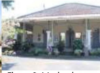
Figure 2. Maskerdam building from the south